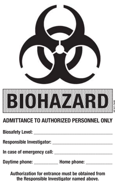
Figure 1. Biohazard warning sign for laboratory doors

However, even though biosafety and laboratory biosecurity are in most respects compatible, a number of potential conflicts exist that need to be resolved.